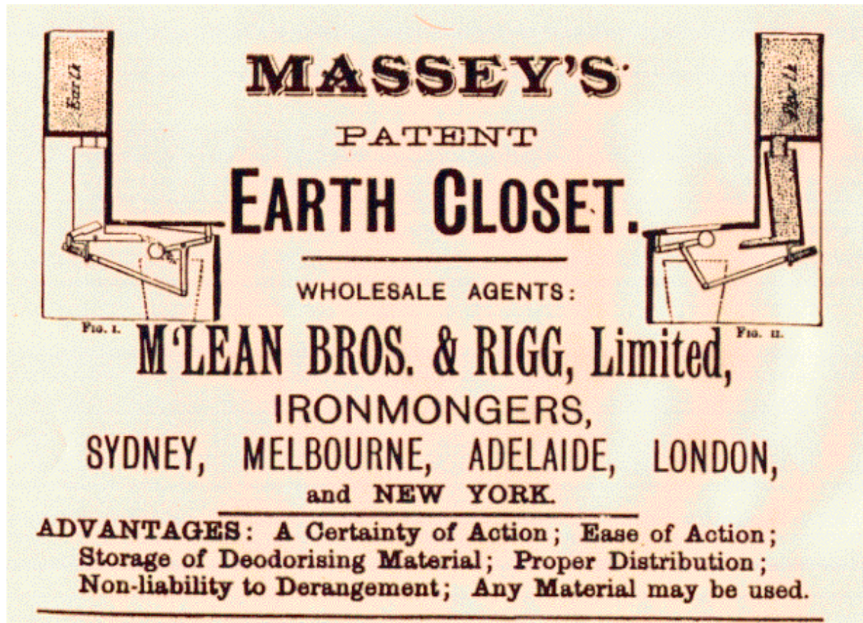
Figure 2.3 Earth Closet Advertisement

It had been the hope of some of the early sanitary reformers that the sewage collected in sewers could be utilised on sewage farms. Chadwick, in Britain, had observed that sewage in Edinburgh was in much demand by the farmers and in his 1842 report and afterwards he persistently advocated the utilisation of sewage. At this time the Herald reasoned that the fact that sewage does not easily mix with sea water was evidence that it wasn't supposed to be put there. Rather it should be used as fertiliser; "We shall not always be able to rob the soil, and give it nothing in return" they warned. 30