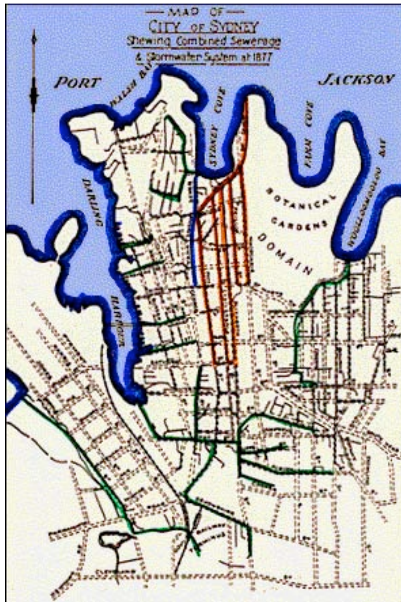
Figure 2.2 Sydney Sewers in 1877

Source: F.J.J. Henry, The Water Supply and Sewerage of Sydney , Halstead Press, Sydney, 1939.